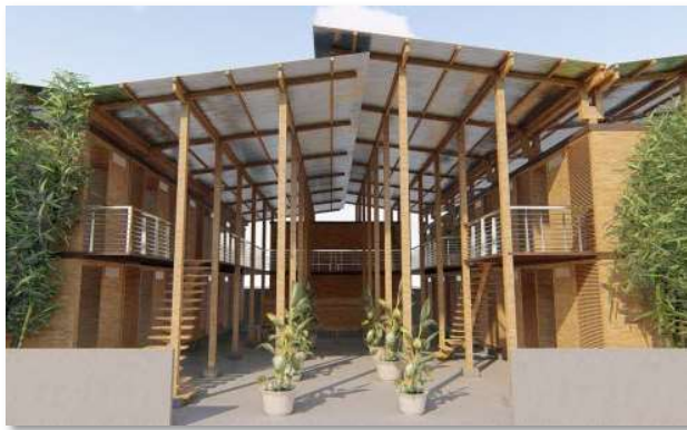
Photograph 3 CUBO: eco-friendly bamboo house, winner of 2018 RICS competition.

Bamboo is a fast-growing grass that is naturally abundant, with 80% of bamboo forests found in Asia and the Pacific. In this region and in South America, bamboo has historically been used for housing, furniture and craft. Bamboo houses are fast to construct and affordable, costing about US$5,000 for a 35m 2 home (INBAR 2016). The International Network for Bamboo and Rattan (INBAR) estimates, over 1 billion people around the world currently live in bamboo houses. Bamboo has high tensile and compressive strengths, good fire resistance and durability when properly processed. Due to their high strength-to-weight ratio, bamboo structures can withstand high velocity wind loads and moderate earthquake loading. The rigorous treatment process to ensure durability and specialized construction techniques pose barriers to the widescale adoption of bamboo (Kaur 2018).