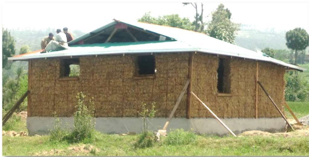
Photograph 4 Construction of straw bale house in rural Pakistan.

Where straw is readily available as a waste product, the costs savings in material production and transportation can be substantial. Diverting straw from the waste stream further stimulates local economy through value creation from waste. As straw needs to be kept dry to prevent deterioration of the material, it may not be suitable in places with high humidity. However, regulatory lag and the wider land area needed for straw bale walls make this an unlikely material to be adopted on a large scale for urban housing. Rather, structural straw panels and insulation blocks are likely to enter the materials market to provide a cost-effective alternative to concrete and brick walls.