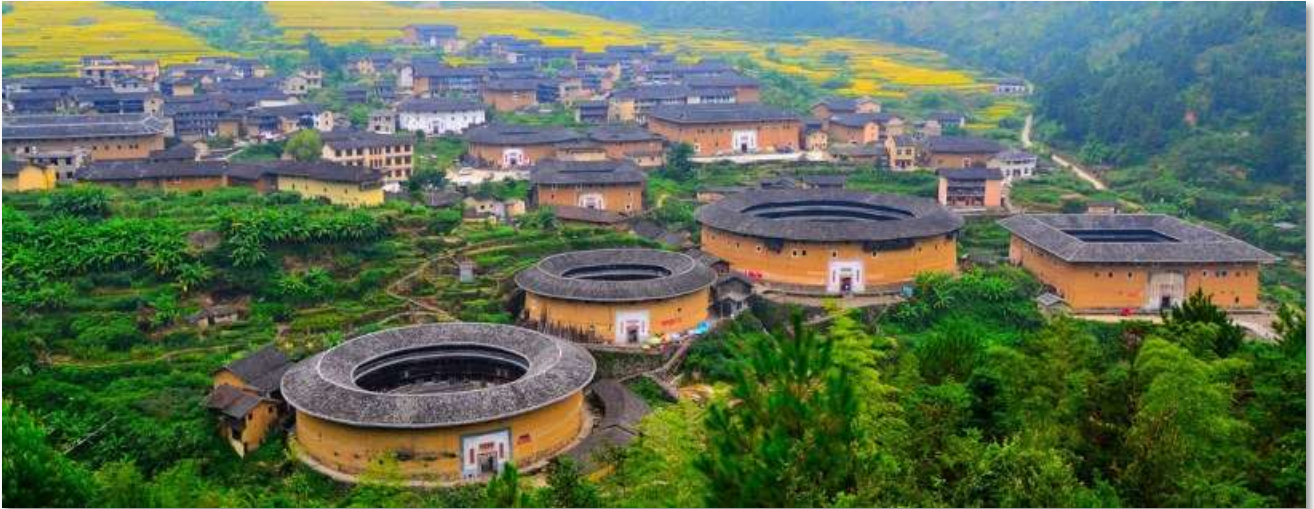
Photograph 12 Fujian Tulou, a UNESCO World Heritage site. Communal buildings are constructed with a mixture of earth, wood, stone and bamboo.