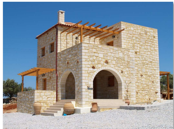
Photograph 6 Stone house in Greece.

Stone has a long history of use as a structural element for homes, religious temples and monuments, with the Egyptian pyramids being the most elaborate demonstration of ancient stone structures. In dry and hot climates, stone provides heavy thermal mass that helps to keep building interiors comfortable. This makes it an attractive low-carbon building material if there is a local source.