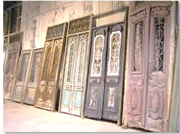
Photograph 7 Resale door frames in a salvage yard.

Reusing building materials is instrumental in reducing the volume of waste produced by the industry while reducing demands on raw materials. There are opportunities for reusing wooden elements such as doors and window frames, floor and wall tiles in new houses. Metal components are easily re-worked and painted for reapplication in a new structure. They can also be smelted and reformed for a completely new structural function. Crushed concrete is often mixed into fresh concrete or asphalt pavements as coarse aggregate to provide bearing strength. However, careful assessment should be made by qualified personnel when reusing materials for structural elements such as beams and columns. Stone waste, fly ash, and similar industrial waste could be used in a concrete mix partly replacing sand, stone and cement components. The reuse of broken bricks, concrete blocks or ceramic tiles for backfilling or compacting applications in the construction site is also viable.