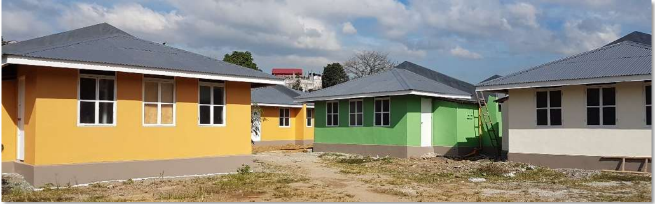
Photograph 11 CBF homes built by Base Bahay in the Bagong Silangan Kawayan Housing Initiative.