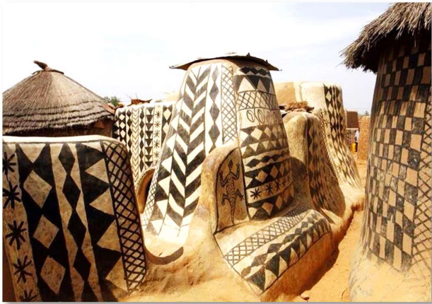
Photograph 5 Traditional mud houses in Burkina Faso.

In recent decades, earth houses have transitioned from subterranean or earth-blanketed structures to construction with earth blocks. This process is faster for construction and requires less maintenance for prevention of moisture penetration. Typically, mud, adobe or earthen blocks are formed, as the basic building block. Where clay content of natural soil is low, additives can be added to enhance workability and durability. One particularly successful method is the Interlocking Hollow Compressed Stabilized Earth Brick (CSEB), discussed in further detail below. Compressed earth blocks require just over 10% of energy needed to produce the same weight in common fired clay bricks (Waziri, Lawan and Mala 2013). Stabilizing of earth blocks can be done with lime instead of cement to achieve comparable strength to concrete blocks. The stabilizer also helps earth blocks to withstand humid environments. Throughout the production and construction process, there is substantial opportunity for training and engaging local labor and businesses.