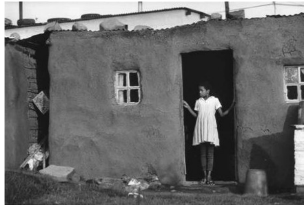
Photograph 1 Child in her earthen house.

pressure on the material supply chain, avoiding the increased material costs from growing global demand while reducing transport-related GHG emissions. At the same time, it also provides opportunities for local economic development. This study takes a life cycle