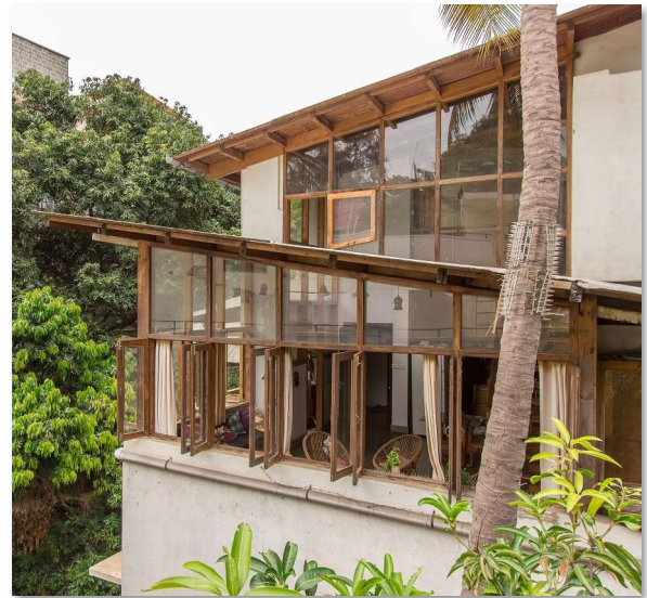
Photograph 8 The Kachra Mane, “Scrap House” in Bangalore, India.

While there is substantial research and experimentation on green concrete, the product remains largely a niche material due to the price and the need for customized engineering (Kamath and Khan 2017).