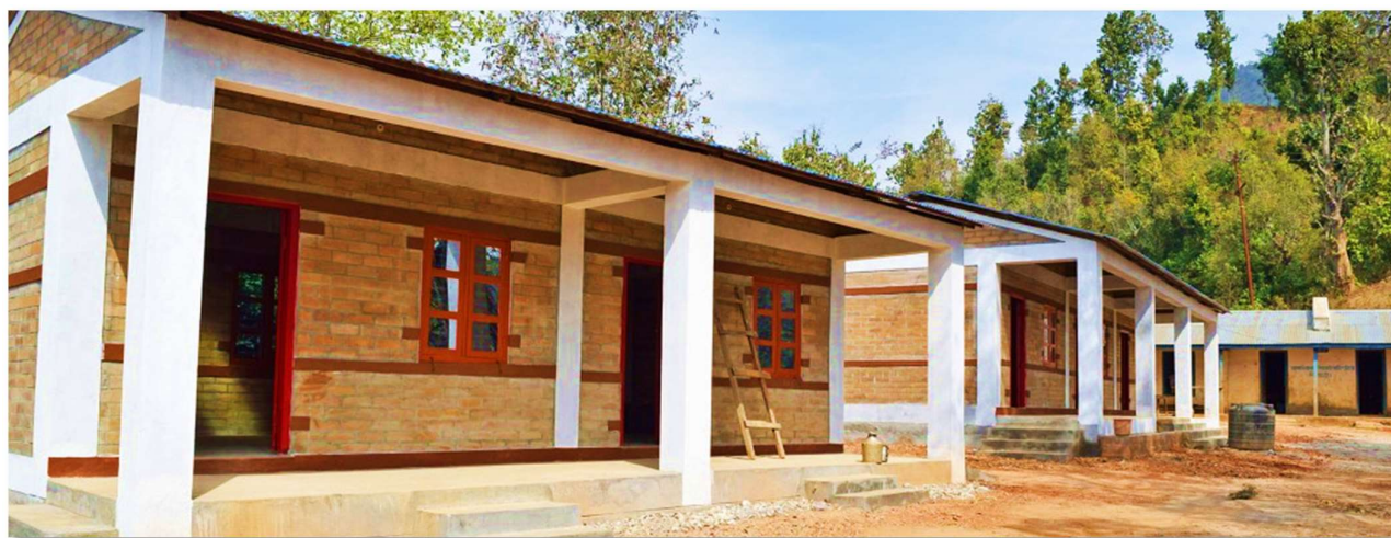
Photograph 10 Classrooms built with CSEB.