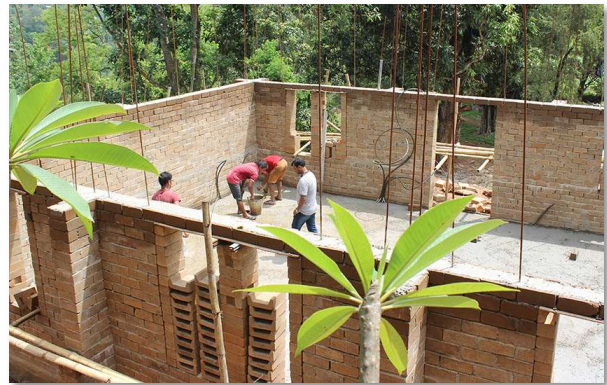
Photograph 9 House construction using CSEB.

rural Nepal using interlocking CSEBs and training local groups and companies to manufacture and construct with CSEBs. Through these projects, Build Up Nepal sought to empower local entrepreneurs with equipment and skills while providing rural communities with affordable and earthquake-resistant homes. Working across the supply chain, the NGO supports local micro and SMEs to promote sustainable and affordable construction materials. CSEB houses are built with local materials and are sustainable, safe and affordable. The use of CSEB as a housing material is approved by the governments of Nepal, Thailand, India and several others. 11 Build Up Nepal estimates that building 50,000 CSEB houses with their design, 495,000 tons of CO 2 will be saved as compared with building with bricks, as is common in Nepal.