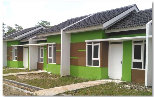
Photograph 2 Low cost housing development in Indonesia, Puri Harmoni 9.

Wood has been used for housing across many countries and cultures for centuries. In recent decades, there is renewed interest in wooden buildings, for their aesthetics, lower cost, shorter construction periods and lower environmental footprint. The Food and Agriculture Organization of the United Nations estimates that approximately 1,330Mm 3 of roundwood is harvested annually for building and construction, with use of wood-based panels and composites increasing across all regions over the past 5 years (FAOSTAT 2018). New construction methods have enhanced the performance and diversity of timber buildings including multi-storied residential and commercial buildings, though these are mostly in developed countries such as Australia and the United Kingdom. 4