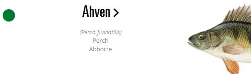
Figure 14: Seafood guide has an easily understandable “traffic light” classification system which guides consumers to responsible fish consumption

WWF's Seafood Guide was developed as a website, which can also be conveniently accessed by an application on a mobile phone. An icon can be added to the mobile phone startup screen, which enables browsing the guide quickly, also without a network connection. This way the consumer can easily make a sustainable choice at the fish counter or in the restaurant. The Seafood guide classifies the seafood into red, yellow and green categories. One fish can have several sustainability classifications depending on the geographic origin of the fish and how it has been fished.