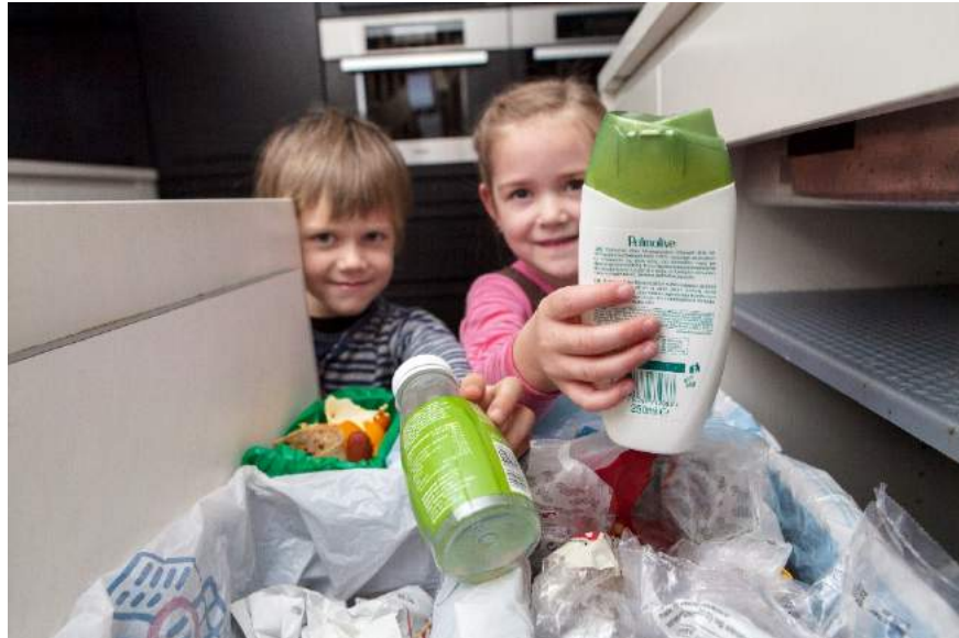
Figure 17: Sortere.no motivating for recycling