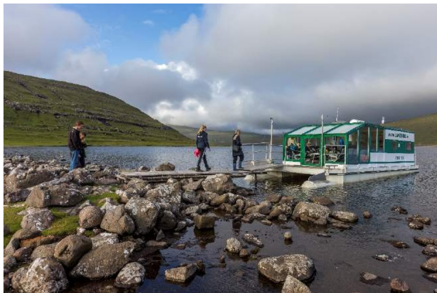
Figure 5: Boarding the boat for an excursion