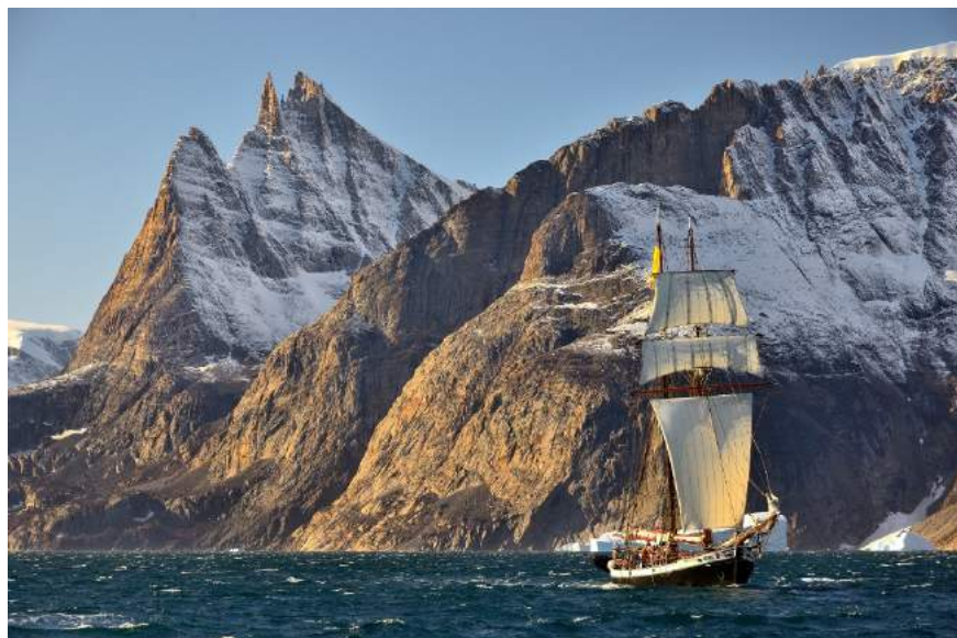
Figure 6: Opal sailing in Greenland