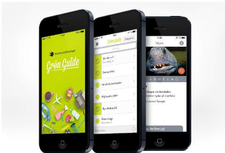
Figure 19: Grön Guide is a mobile application on sustainable choices