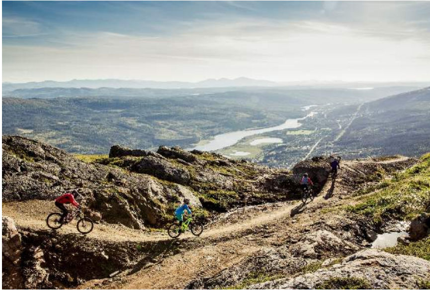
Figure 10: Downhill biking at Åre Bike Park, Sweden