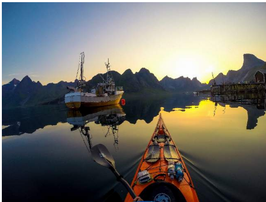
Figure 8: Fishing boat and kayak on Kjerkfjorden, Lofoten