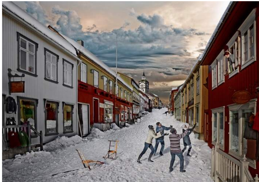
Figure 7: Destination Røros