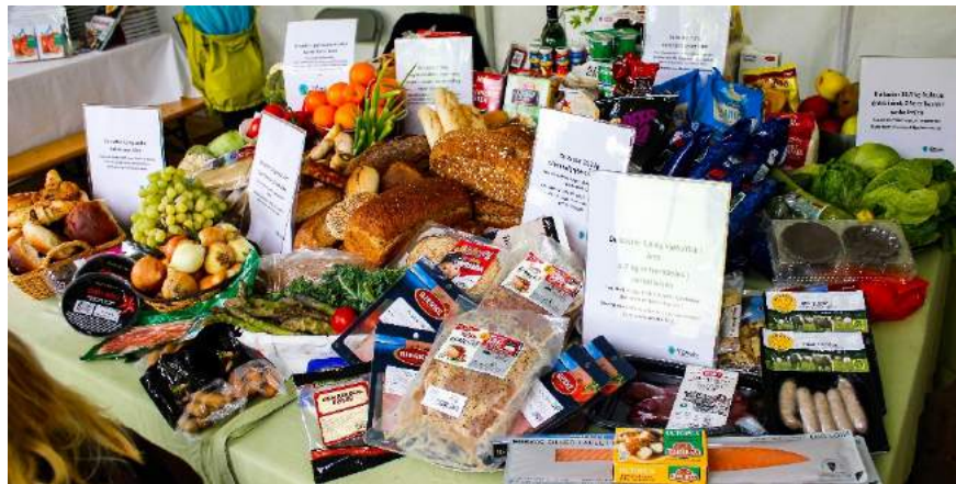
Figure 16: Food Waste Table illustrating the yearly amount of different categories of food wasted by an average Norwegian