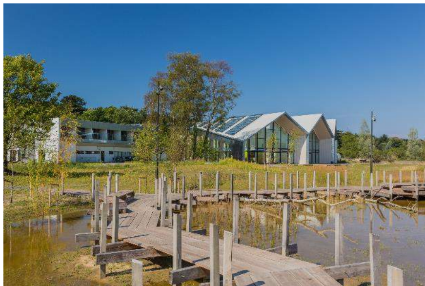
Figure 1: Green Solution House and its surroundings