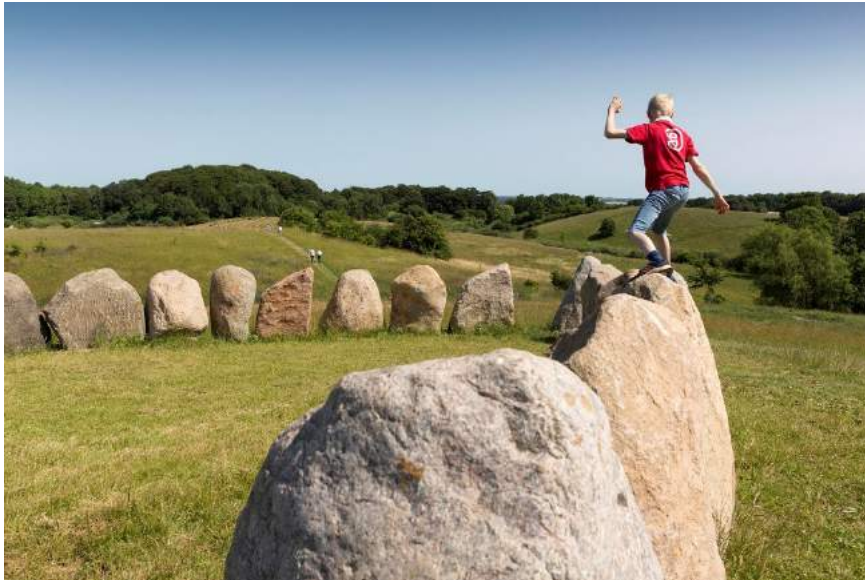
Figure 2: Sagnlandet – Land of Legends at the national park Skjoldungernes Land