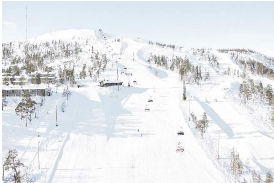
Figure 3: Pyhä is the first carbon neutral ski resort in Finland next to Pyhä-Luosto National Park