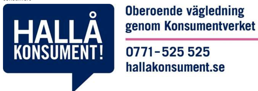
Figure 18: Hallå Konsument – Hello Consumer is a Swedish national information service for consumers