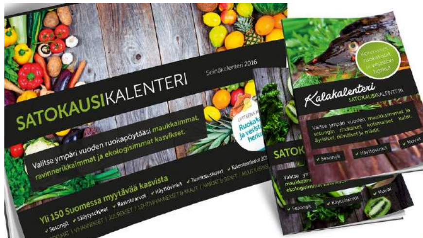
Figure 15: The harvest season calendar is available as a wall calendar, booklet and mobile application