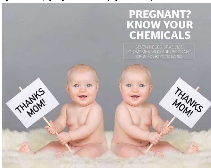
Figure 11: The campaign targets women who are pregnant or who hope to be so