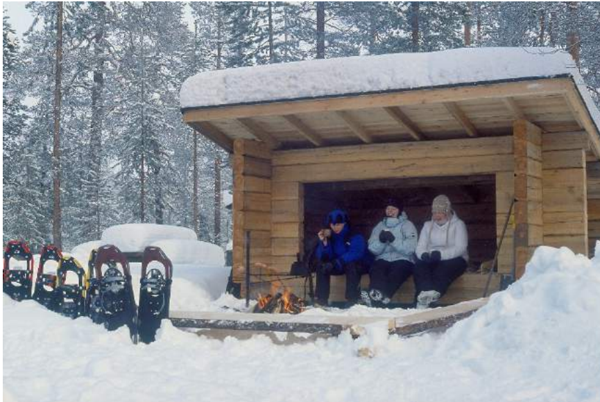
Figure 4: Snowshoe trekking pause in Pyhä-Luosto National Park