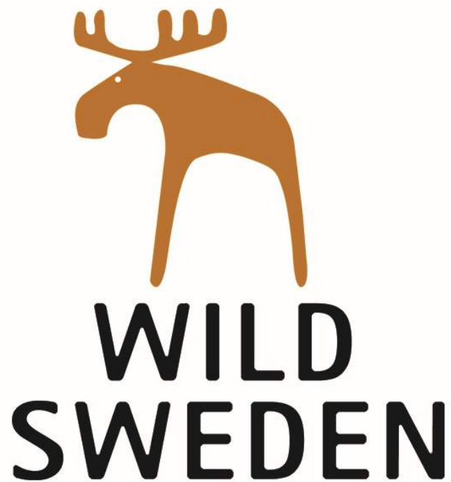
Figure 9: Wild Sweden organises trips to the Nordic wilderness