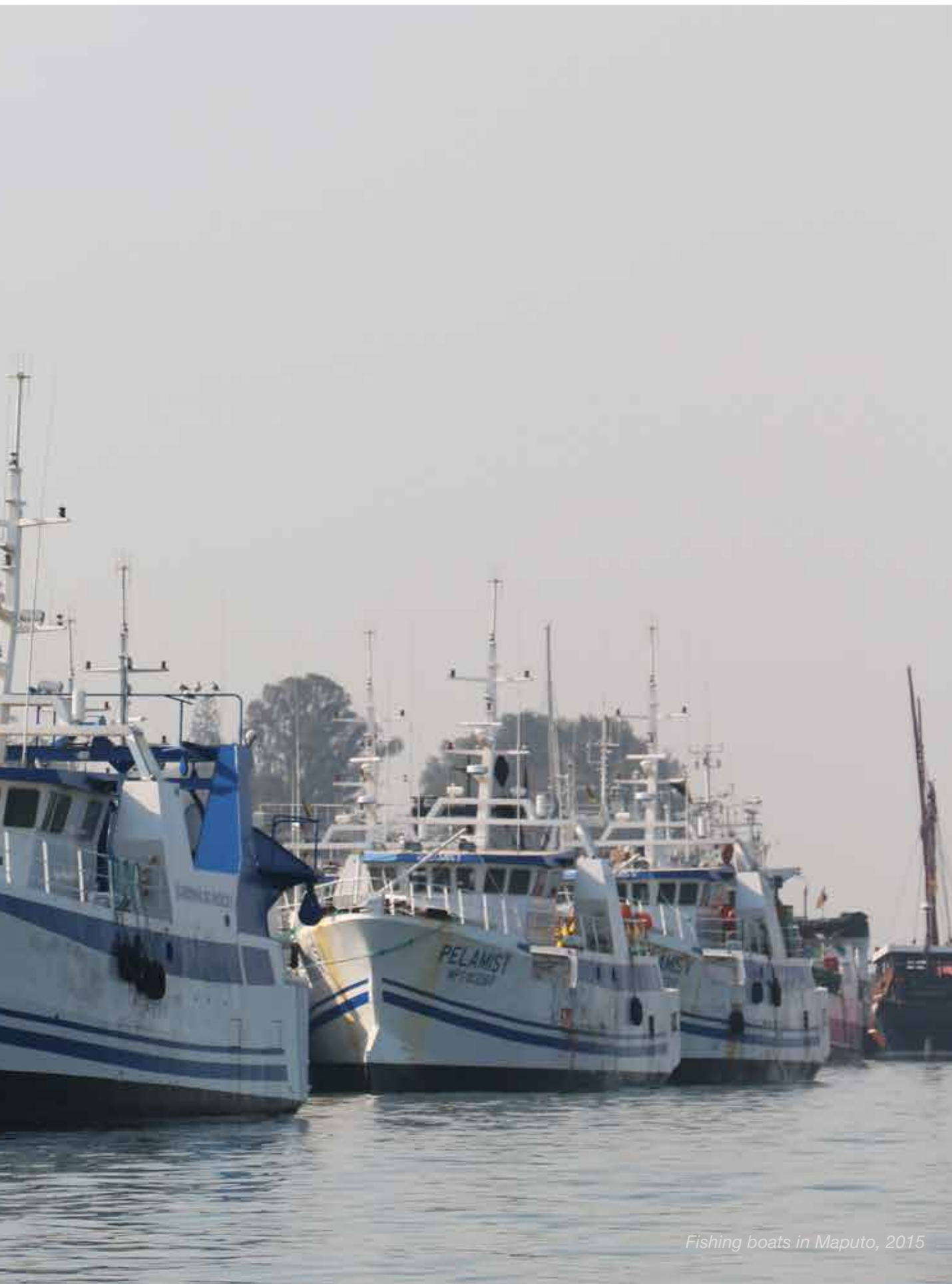
Fishing boats in Maputo, 2015