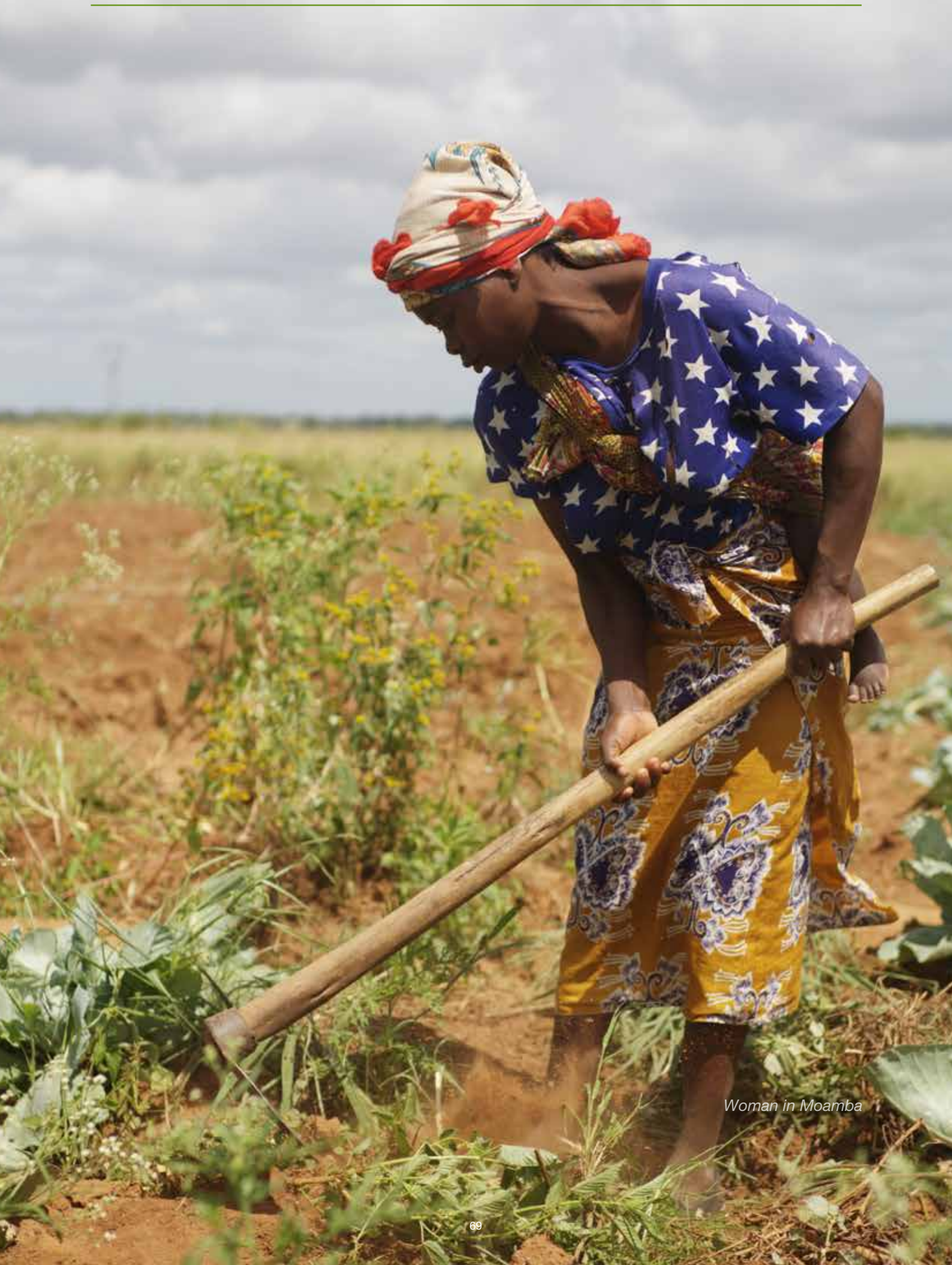
Woman in Moamba