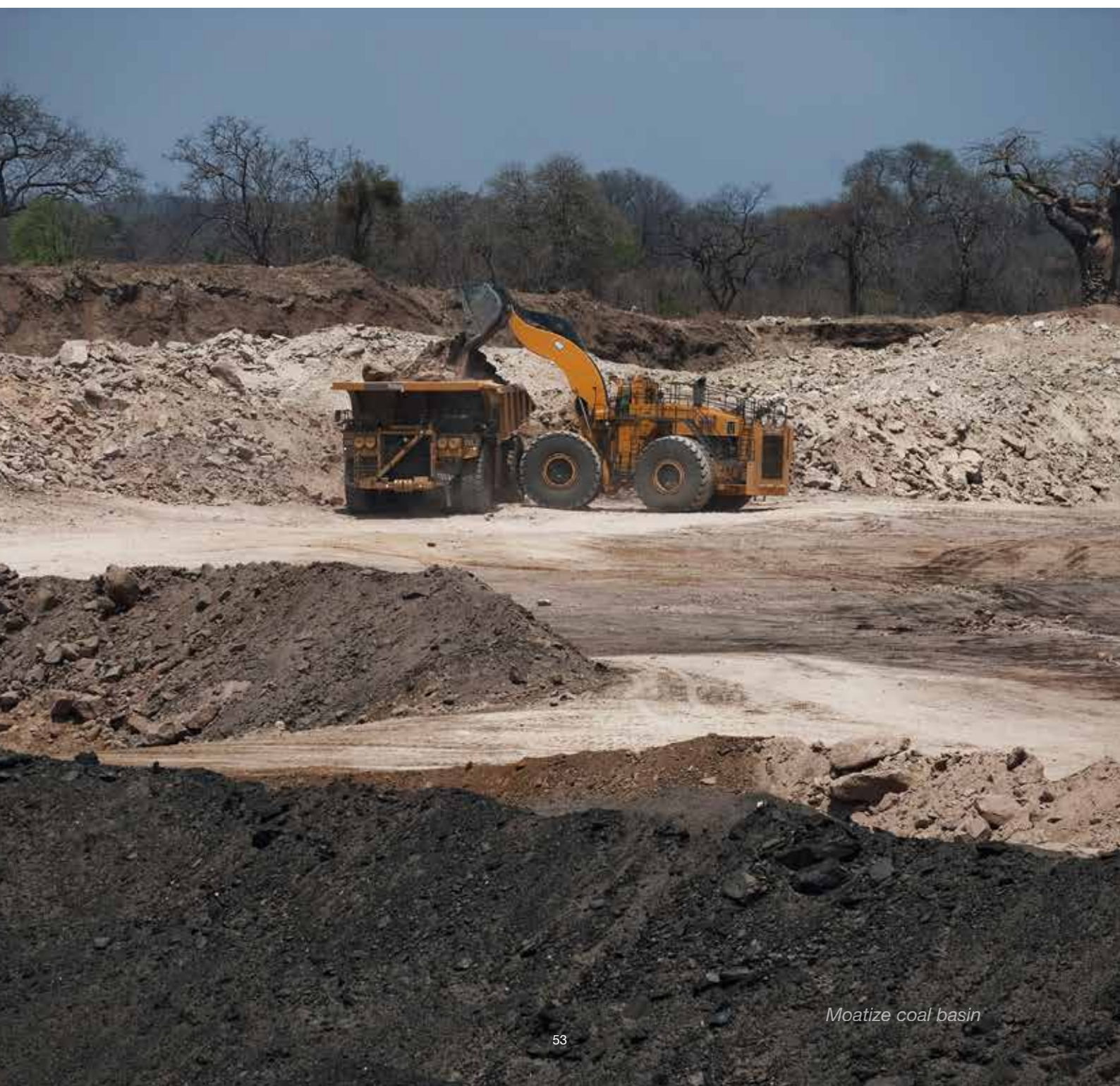
Moatize coal basin