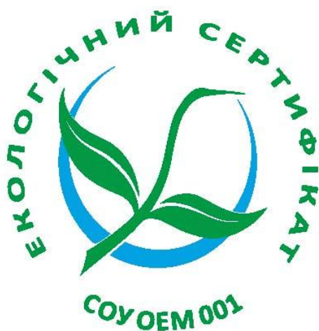
Picture 1. Ukrainian logo for eco-labelling

Certification authority body “Living Planet” is accredited under the International Coordination of Certification Systems of Environmental Labelling