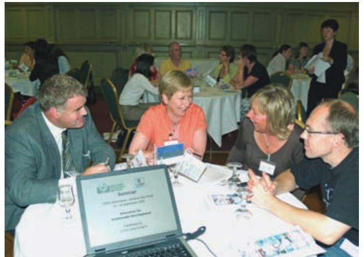
CCN Task Group 8 running an ESD seminar with Civic Social & Political Education (CSPE) facilitators, in Athlone, Ireland, 2007.

In our search for a sustainable future we need to redefine our position in relation to the environment. We cannot afford to continue to replicate our mistakes. We must search for better solutions based on ESD values and transformative learning approaches can help this process.