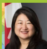
Soyoung Park Canadian Deputy High Commissioner