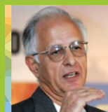
ARUN MAIRA Former Member, Planning Commission of India