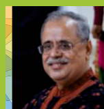
ATUL BAGAI Head of Country Office India, UNEP