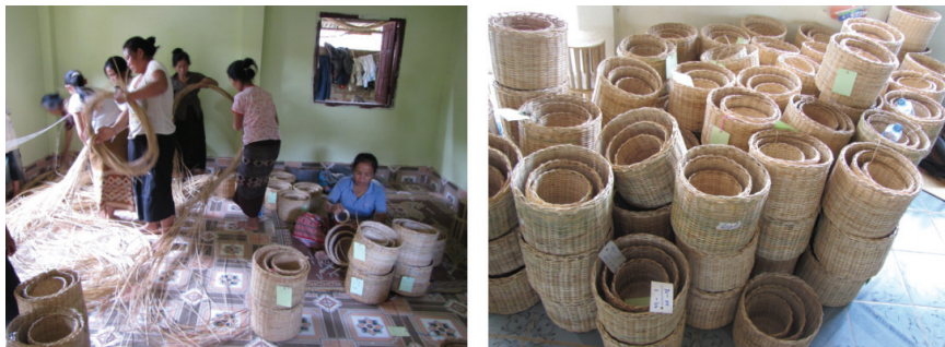
Figure 8.1: Pongpatao villagers making rattan baskets, Bolikhamxay province, Lao PDR

Due to its success, the project was continued in phase III until 2014 with funding from IKEA. The objective was to strengthen the project's achievements through the following main activities: