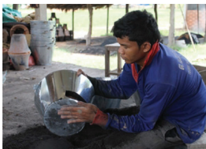
Figure 8.3: Testing and production of the ICS

Further project information is available on: www.switch-asia.eu/projects/cook-stoves-programme-laos/www.snvworld.org/en/countries/lao-pdr .