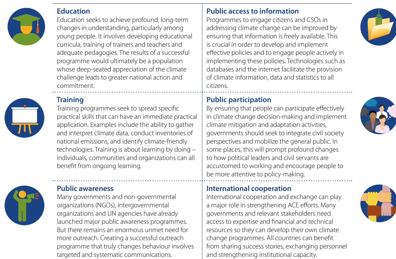
Table 2 • Characteristics of each ACE element