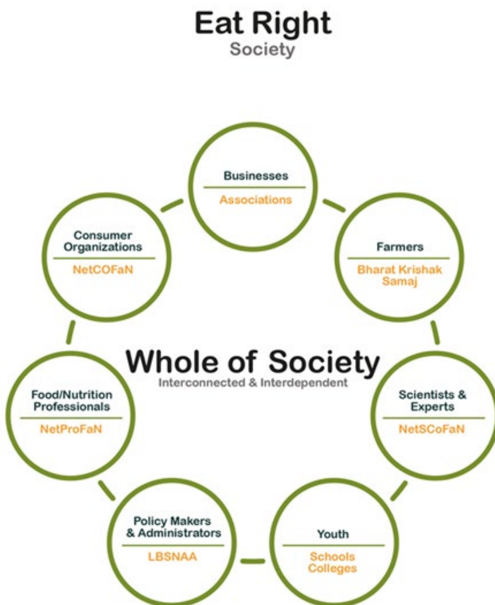
Figure 42. Eat Right India's whole-of-society approach

in terms of types of organizations (constituencies), sectors and food systems activities represented. Farmers and their organizations, as well as grassroots community organizations, are not yet directly represented. However, the FSSAI is engaged in consultative discussions with them through the Steering Committee, as they fall within the ambit of the Ministry of Agriculture.