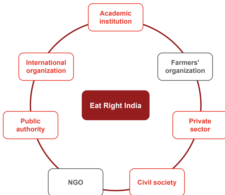
Figure 43. Types of organizations (constituencies) represented in Eat Right India (in red)