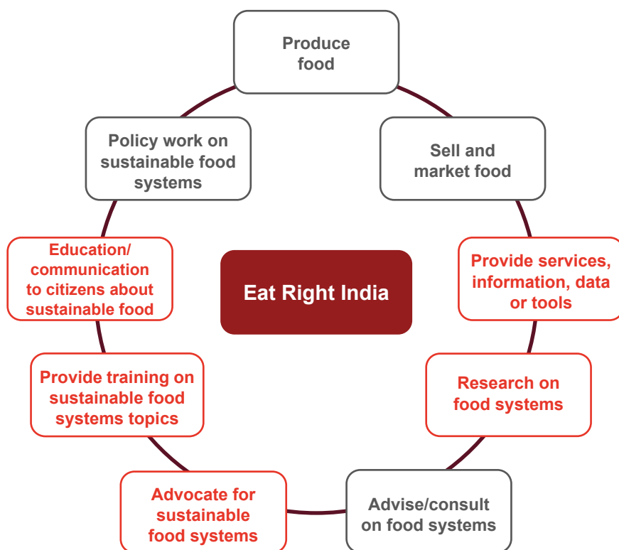
Figure 45. Activities represented in Eat Right India (in red)