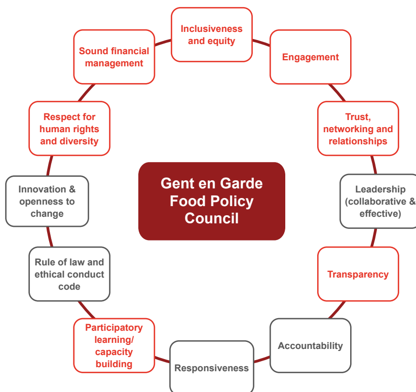
Figure 50. Good governance principles practised by the Gent en Garde FPC (in red)

In addition to regular meetings, participants also communicate regularly through emails, discussions and written consultations, for example.