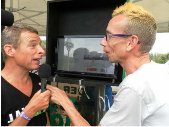
Figure 4 Dutch comedian and environmental advocate Dolf Jansen (on the right).

In December 2011, we launched the “Voeroe” (a compound of the Dutch words for “food” and “guru”) as an innovative form of viral marketing. A fabricated Twitter personality, the “Voeroe” sent out 100 personal tweets with video messages to opinion leaders in the field of food and nutrition and to Dutch celebrities selected on the basis of their total number of Twitter followers. This resulted in a further 548 tweets and reached approximately 268,634 consumers.