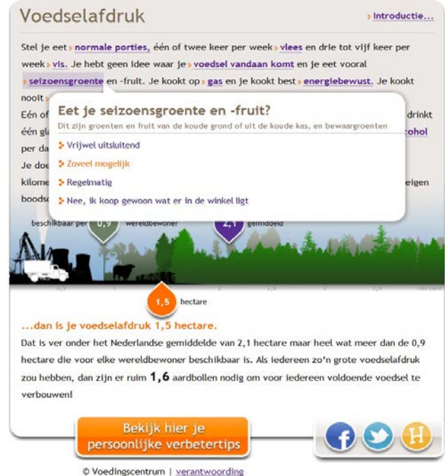
Figure 1 Online interface of the foodprint tool.

There are fifteen multiple-choice questions, based on a comprehensive selection of the system boundaries for the environmental impacts of food production and consumption. To make the foodprint tool as complete as possible, all the factors that have an impact on the EF and can broadly be attributed to food consumption are included: food and drink production and transport, food waste, energy use for cooking, mobility for grocery shopping, and packaging. The selected fifteen issues that contribute substantially to the foodprint are as follows: portion size; meat consumption; fish consumption; use of regional products; use of seasonal fruits and vegetables;